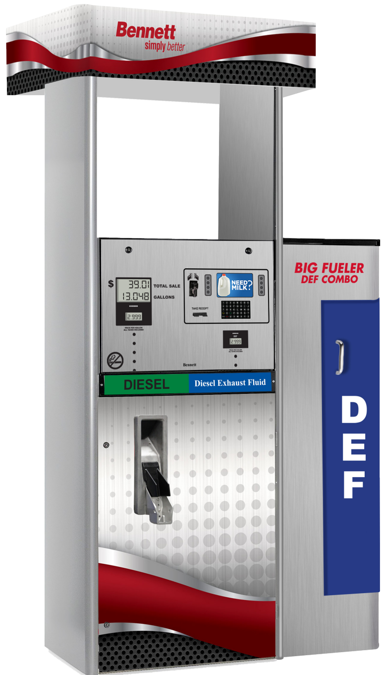
420E High Hose BigFueler DEF Combo

Optional DEF heating system for use in cold weather applications