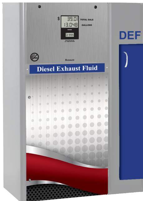
410D DEF Dispenser