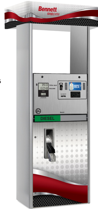
Big Fueler shown with Alphanumeric Keypad and 7" Widescreen Display