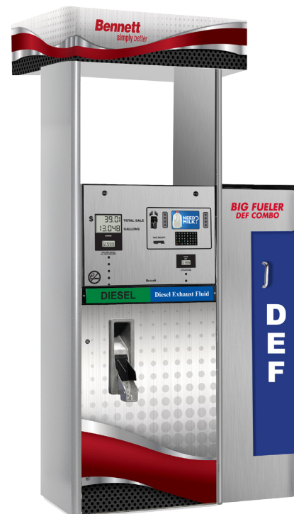
Big Fueler Diesel/DEF Combo shown with Alphanumeric Keypad and 7" Widescreen Display

Flow rates are nominal rates under test conditions. Actual rates will vary subject to installation conditions, hanging hardware used and submerged pump (if applicable).